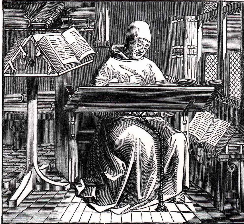
SCRIPTORIUM MONK AT WORK. (From Lacroix .)