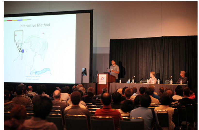
SIGGRAPH conference talk